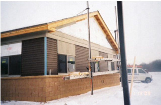
Santiago Township Fire Station & Town Hall