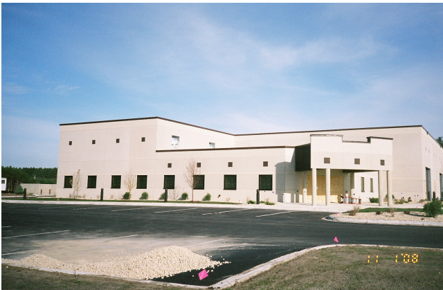
Sherburne County - Zimmerman Public Safety Building