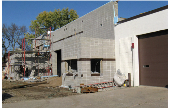
Jordan Fire Station Addition & Remodeling