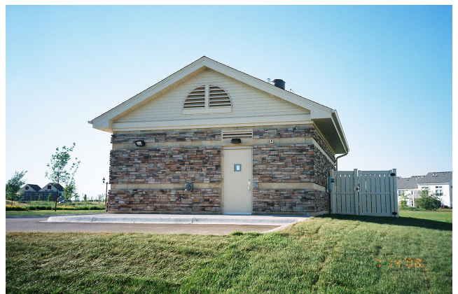
Hugo Well House

At JEA ARCHITECTS, we work on your behalf to increase project quality and value by eliminating unnecessary costs while solving your building needs.