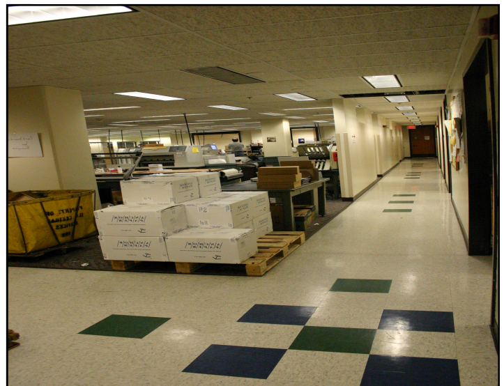
Hennepin County Government Center Central Services Remodeling, Mpls, MN

At JEA ARCHITECTS, we work on your behalf to increase project quality and value by eliminating unnecessary costs while solving your building needs.