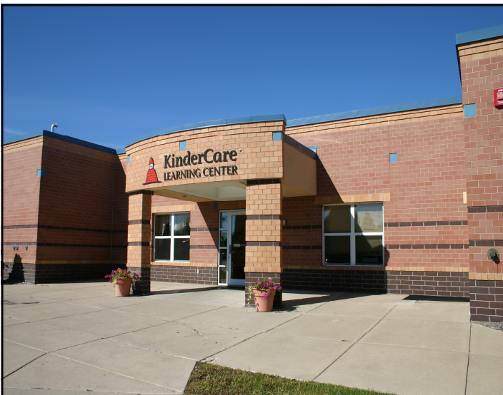
KinderCare Learning Center Plymouth, Minnesota